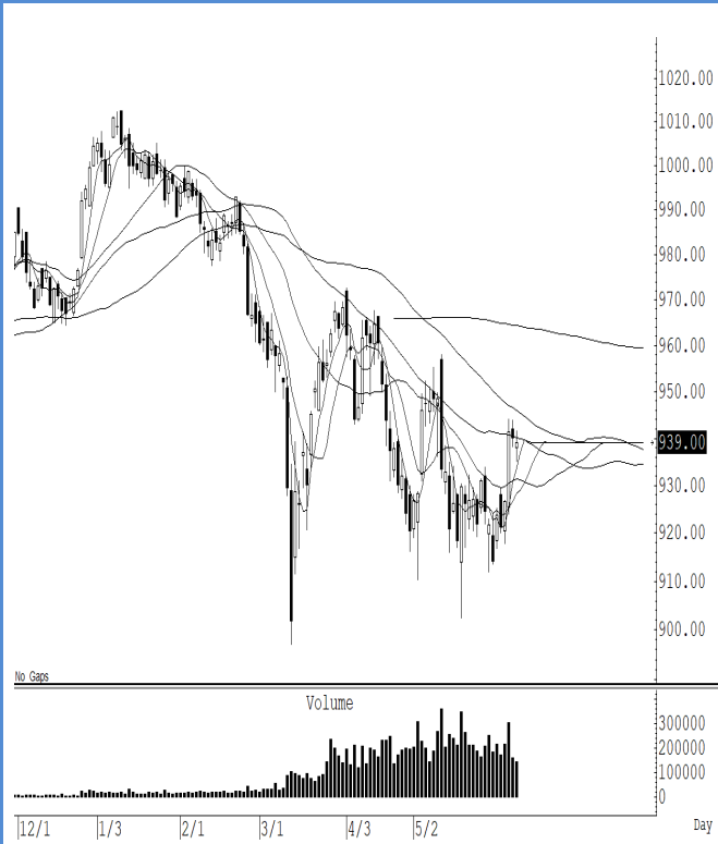
S50M23 (Close 939.0 Chg -1.10)